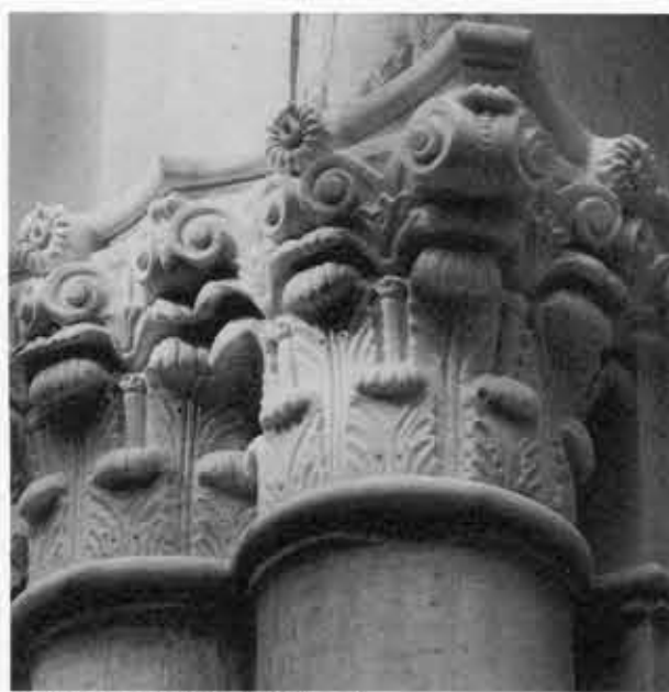
New capital, Fleming School.