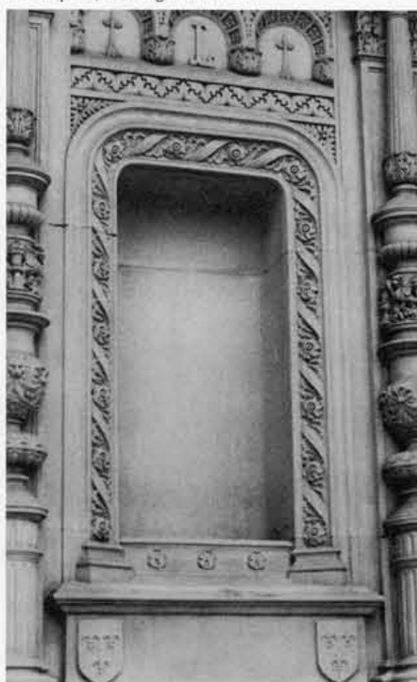
Niche at Carnegie Mellon School of Fine Art.