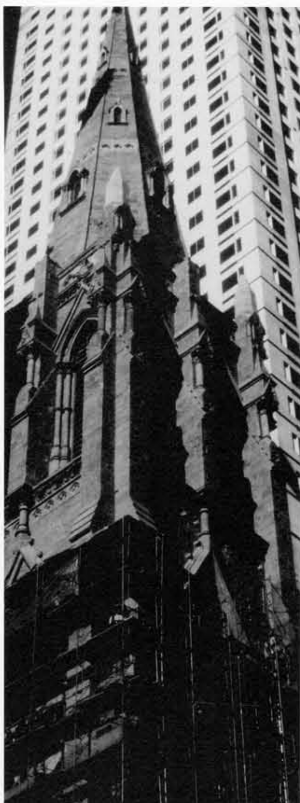
Fifth Avenue Presbyterian Church.